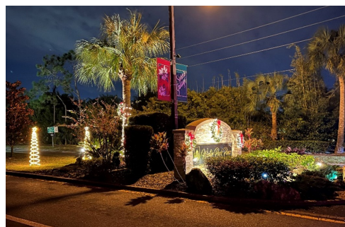
Front Mall Entrance